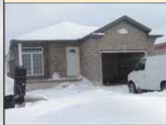
963 Bitterbush Cres. BRAND NEW BUNGALOW