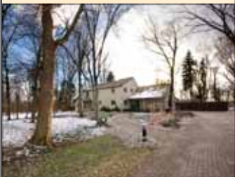
32 Lansdowne Park Cres. Exclusive Property