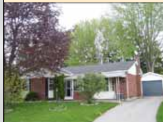
25 Cluney Place February Sale - 1 Week!