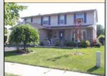
64 Dunsmoor Rd. 5+1 Bed with Pool!